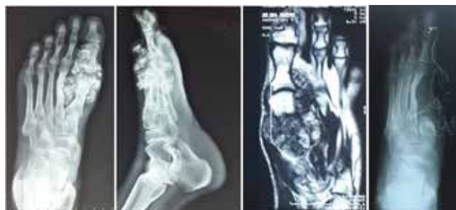
Figure 1. case no.1: chondrosarcoma around the first MTP joint, in the radiograph and MRI images, aggressive expansile tumoral lesions stemmed from the first metacarpal bone with the apparent extension to the soft tissue and having chondroid matrix is presented. a) ap x-ray b) lateral x-ray c) coronal + axial MRI section d) postoperative ap x-ray

pointense areas were observed on T1W images; In STIR images, low-signal areas that likely to represent calcification were observed in high-signal areas. Early contrast enhancement areas were present in the contrast study. Spreading to soft tissue and early contrast enhancement of the lesion provided a departure from other tumors involving chondroid matrix that show benign features. Incisional biopsy was done under spinal anesthesia. Histopathological examination revealed a low-grade CS. First ray resection was performed (figure 1 a-d).